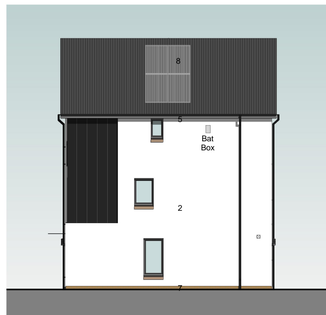
4 Proposed North-West Elevation 1: 100