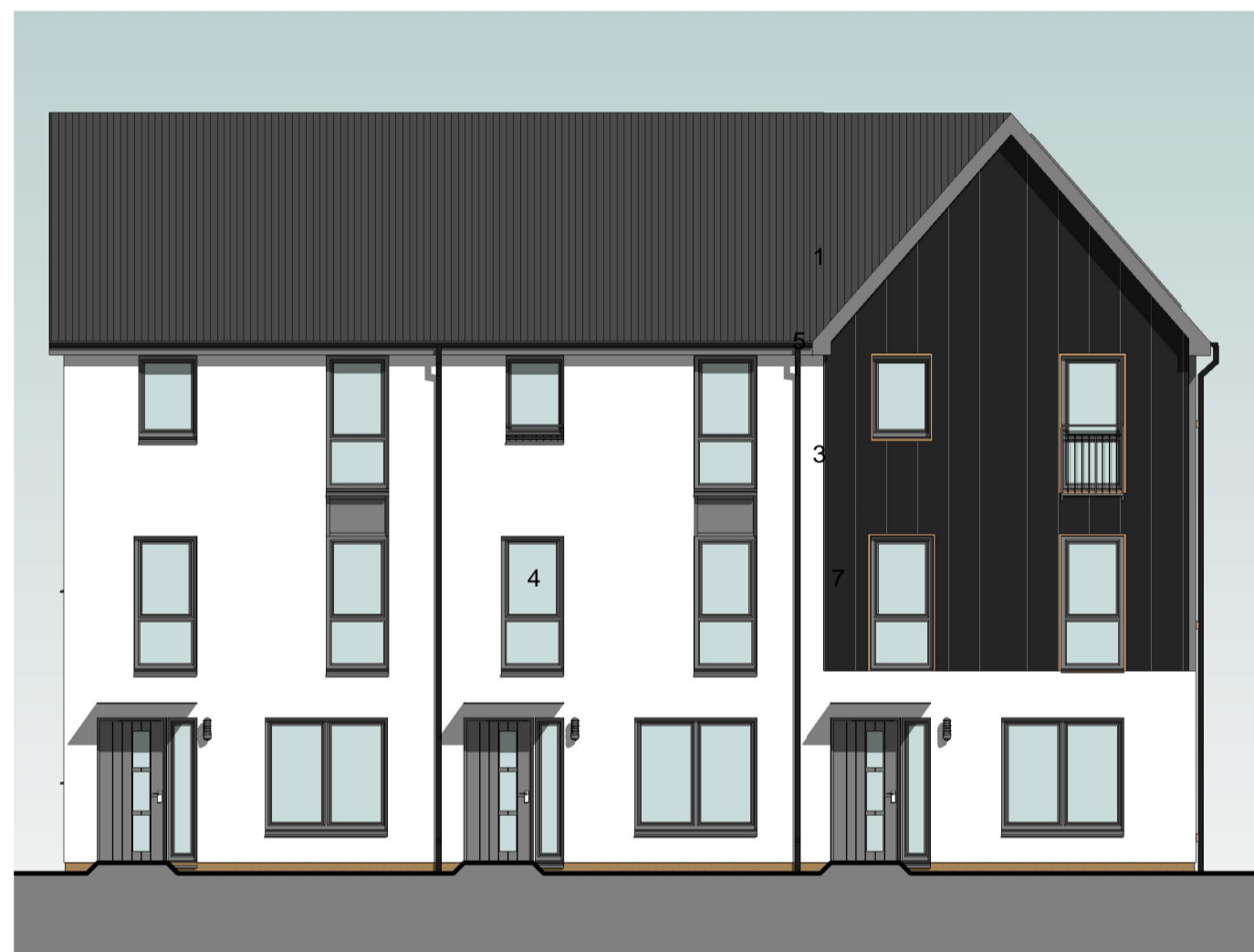
1 Proposed North-East Elevation 1: 100