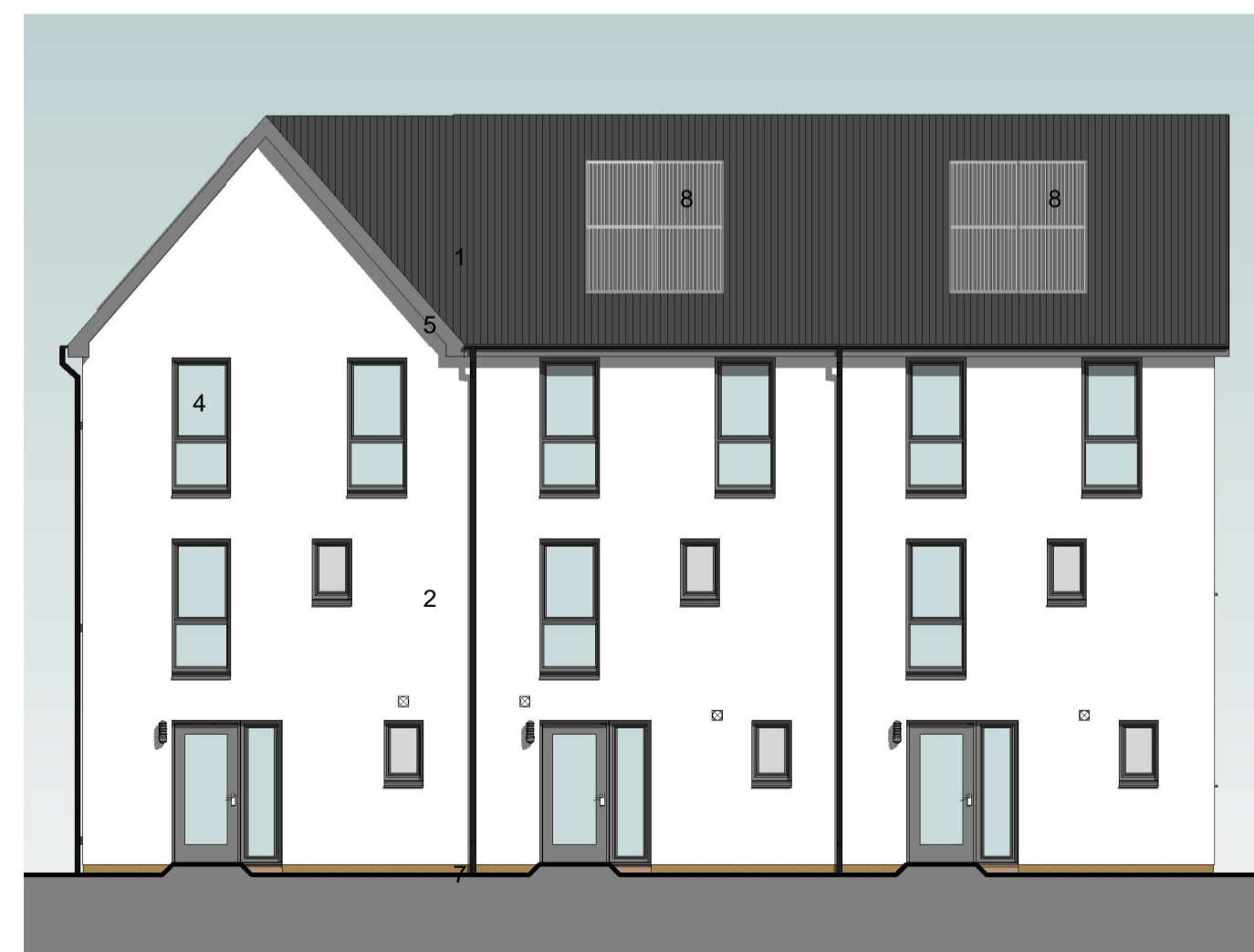
3 Proposed South-West Elevation 1: 100