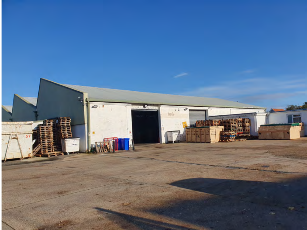
Unit 16-18 pre-refurbishment

Individual Units from 3,805 sq ft to 16,189 sq ft