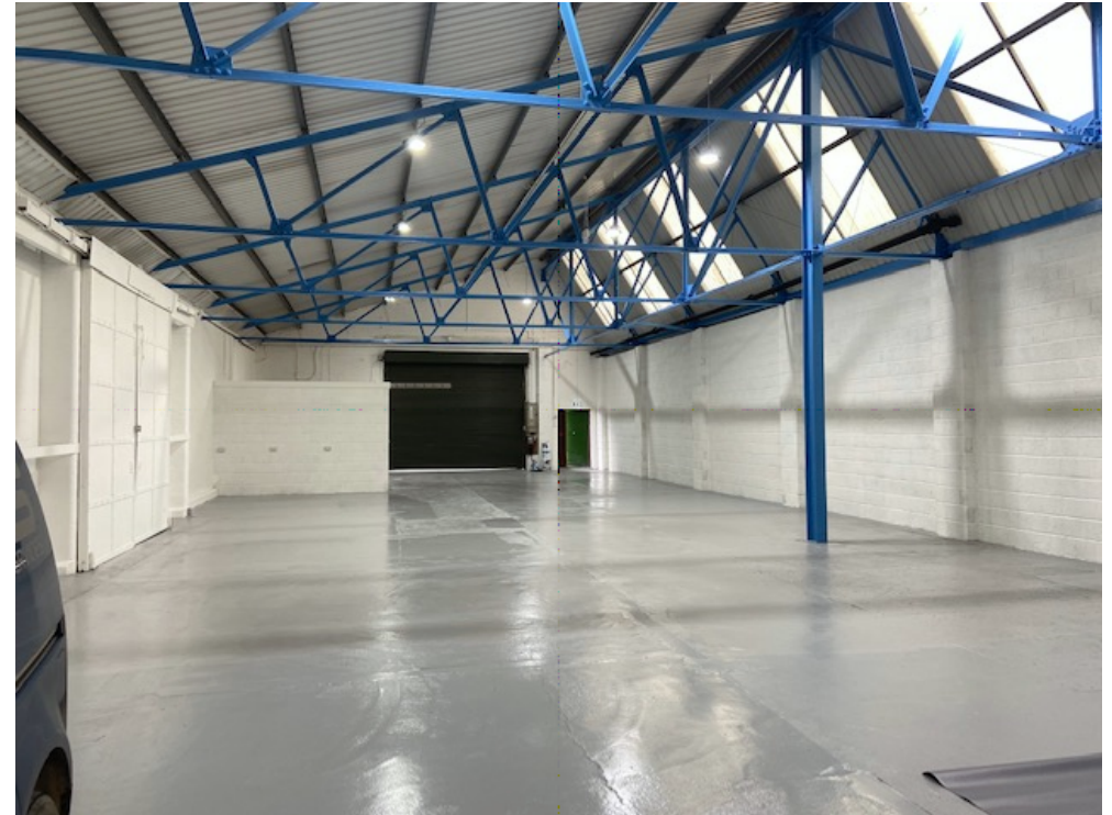
Single Unit on estate post-Refurbishment