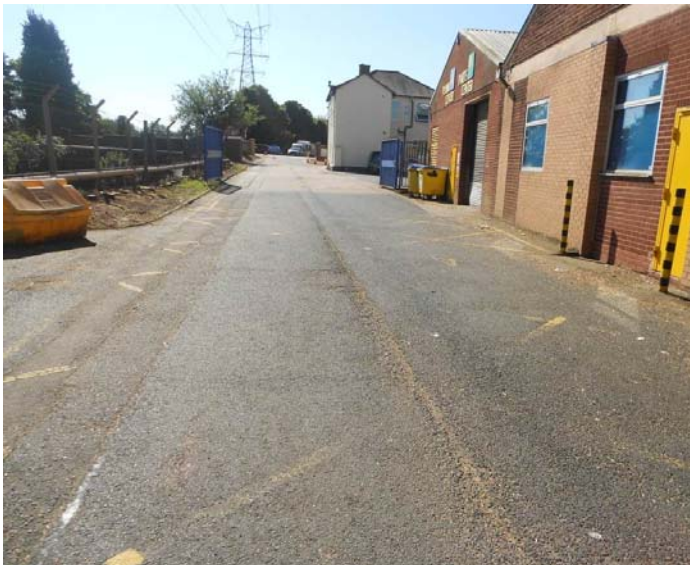
Main Entrance Driveway