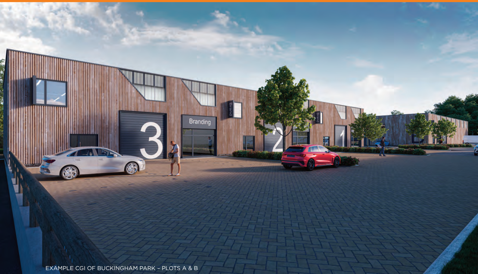
EXAMPLE CGI OF BUCKINGHAM PARK - PLOTS A & B

BUCKINGHAM PARK • BROOKS ROAD • LEWES • BN7 2FB