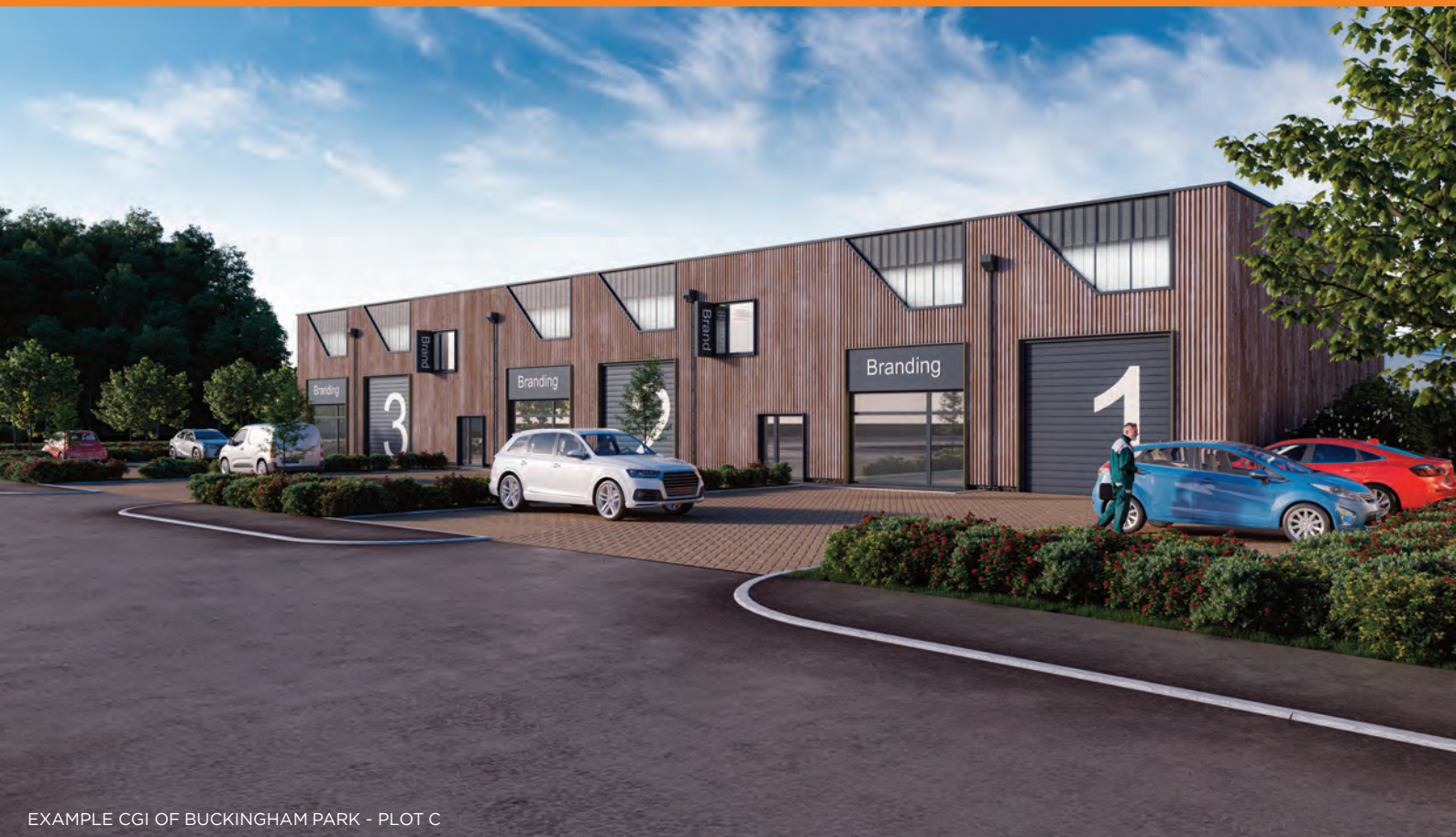
EXAMPLE CGI OF BUCKINGHAM PARK - PLOT C

BUCKINGHAM PARK • BROOKS ROAD • LEWES • BN7 2FB BRAND NEW BUSINESS UNITS - TO LET