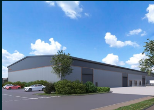
Indicative warehouse external