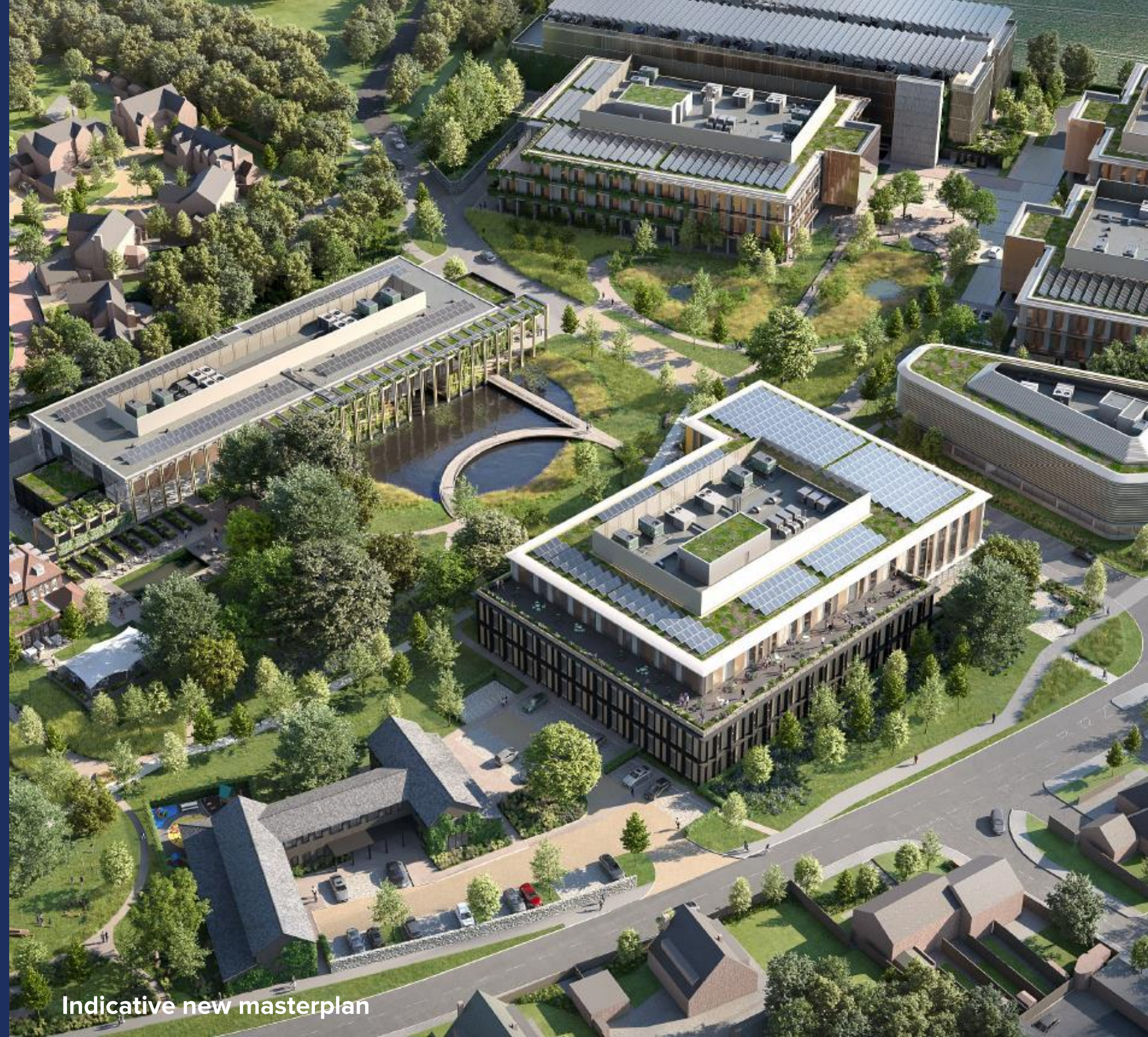
Indicative new masterplan

Dowley Turner Real Estate LLP on its behalf and for the Vendors or Lessors of this property whose Agents they are, give notice that: 1. These particulars are set out as a general outline only for guidance to intending Purchasers or Lessees, and do not constitute any part of an offer or contract. 2. Details are given without any responsibility and any intending Purchasers, Lessees or Third Parties should not rely on them as statements or representations of fact, but must satisfy themselves by inspection or otherwise as to the correctness of each of them. 3. No person in the employment of Dowley Turner Real Estate LLP has any authority to make any representation or warranty whatsoever in relation to this property. 4. Unless otherwise stated, all priced and rents are quoted exclusive of VAT. September 2023.