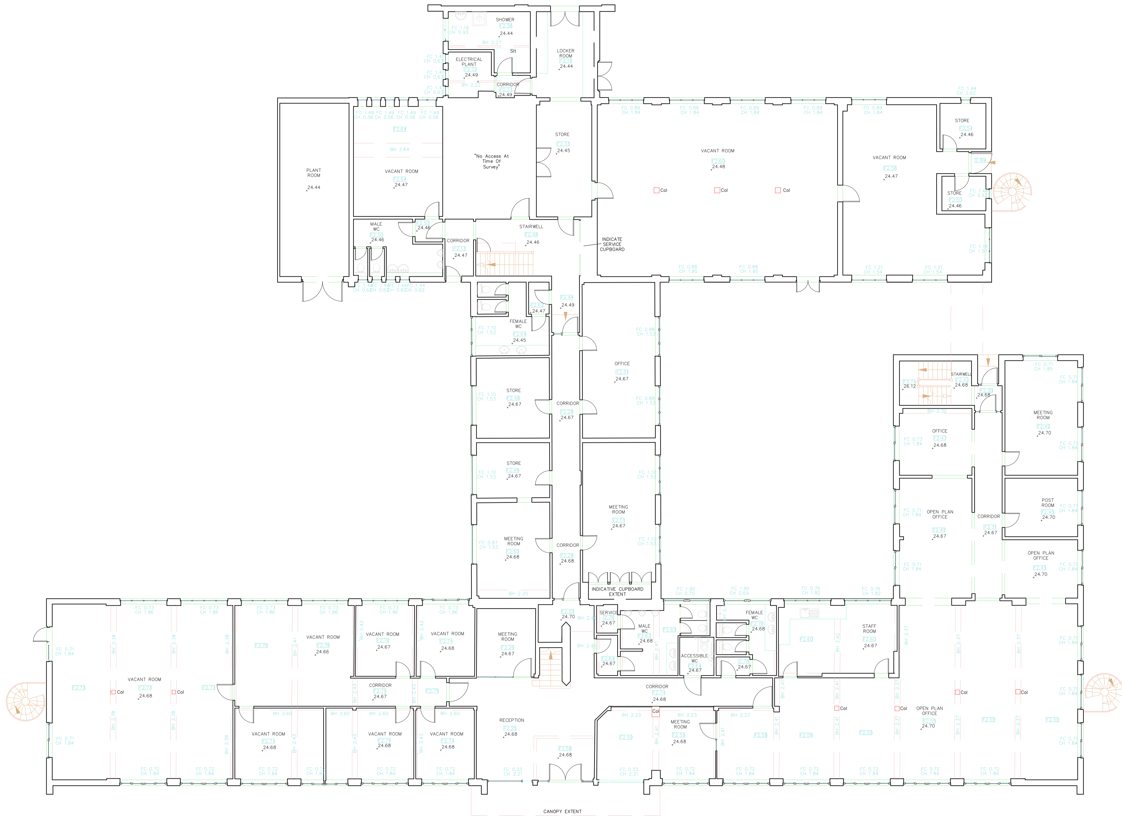
01 Existing GA Ground Floor Plan 1:100 @ A1