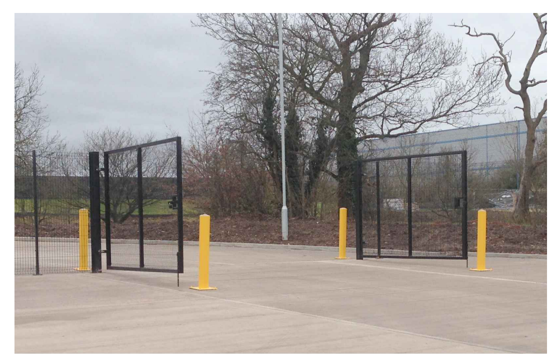
Proposed paladin security gates