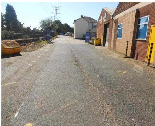
Main Entrance Driveway