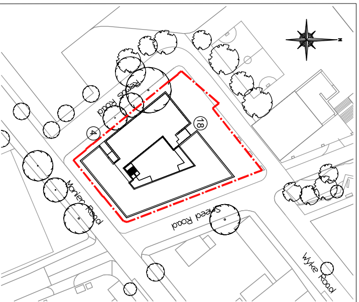
LOCATION PLAN Scale 1:1250 @ A4