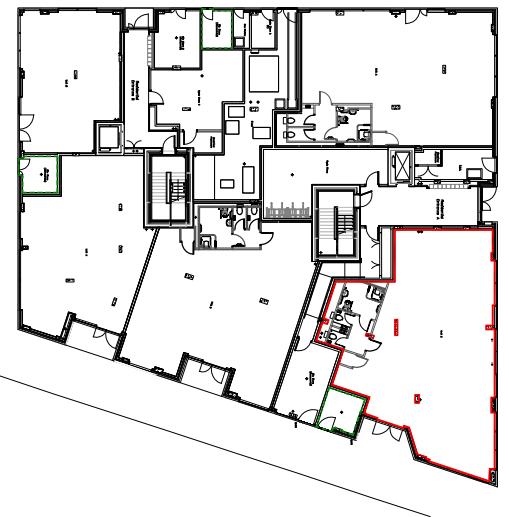
Gnd Floor Overview - nts