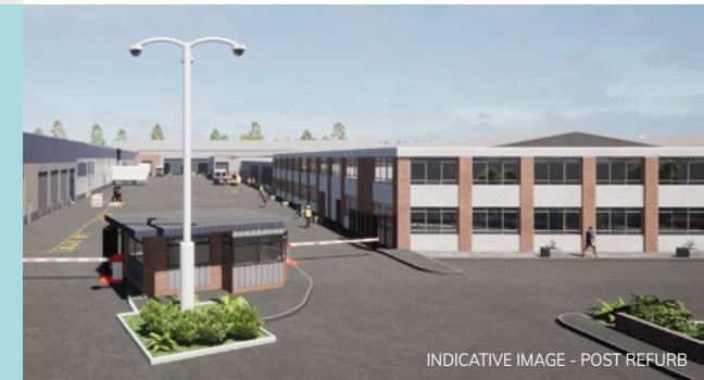
INDICATIVE IMAGE - POST REFURB

All prices quoted are exclusive of VAT, which for the avoidance of doubt, may be chargeable at the prevailing rate.